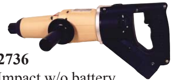
Cat. No. 2736 Cordless Impact w/o battery