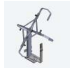
Support & Mounting Plate