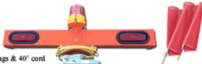
Light Bar w/ strobe light, 2 flags & 40' cord