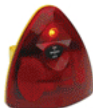
Replacement Red LED Cat No. - 7028