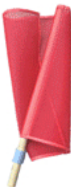
Red Flag Cat. No. 7074

Dimensions: Flags 18" x 18" (Square) Wood Staff & PVC end: 24" Long