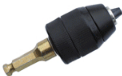
1/2" Keyless Chuck Kit Cat. No. 2530

Keyless 3 jaw chuck adapter for use with impacts to drill holes in steel, wood or fiberglass