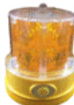
Replacement 360 LED Amber Cat No. - 7164