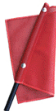
Red - Cat. No. 7144 Orange - Cat. No. 7247 Heavy Duty 1" Nylon Dowel