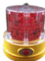
Replacement 360 LED Red Cat No. - 7169