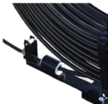
Cat No. 5730 for 1/2" HDPE Gas Distribution Pipe