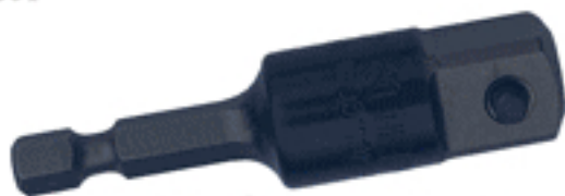
Little Bully® adapter 1/4" to 1/2" sq. Cat. No. 2802