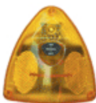
Replacement LED Amber Cat No. - 7030