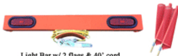
Light Bar w/ 2 flags & 40' cord