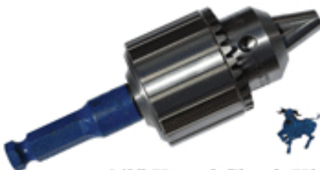
1/2" Keyed Chuck Kit Cat. No. 2590

*Not for use with bits that cause continuous impacting