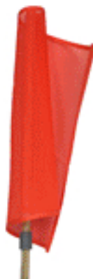
Orange Flag Cat. No. 7474