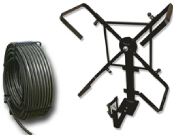
Cat No. 5740 for 1" HDPE Gas Distribution Pipe